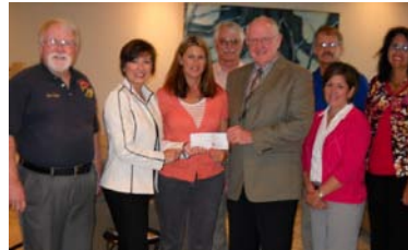
Donation to Fisher House Eglin AFB, FL