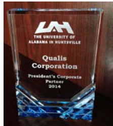
President's Corporate Partner for 2014