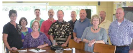
Fort Walton Beach, FL